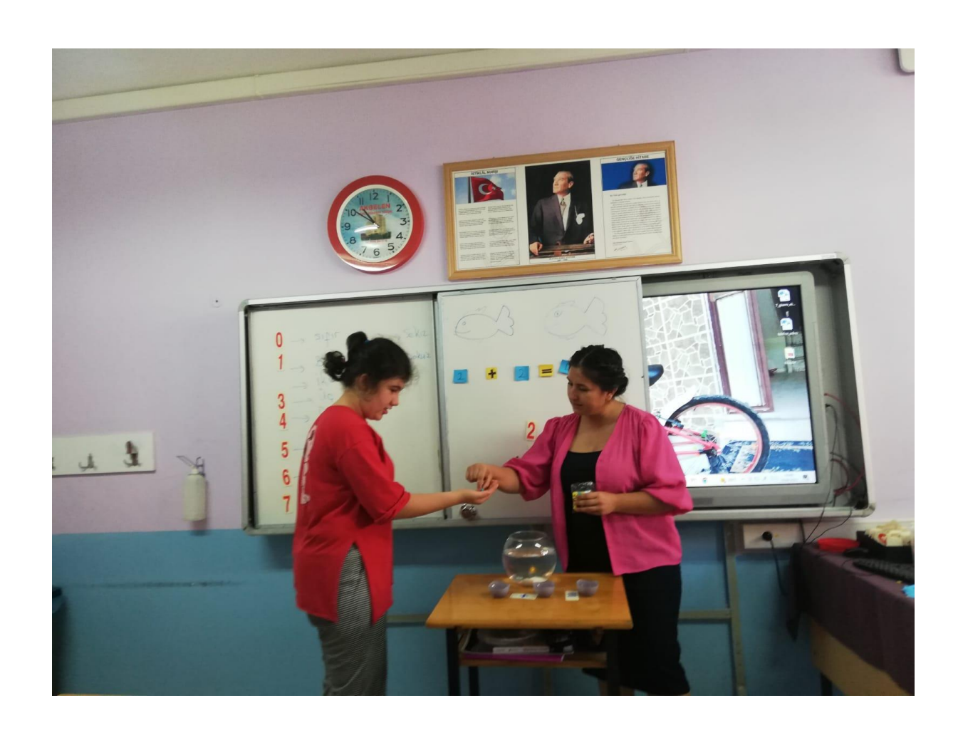
*Learning humane animal care