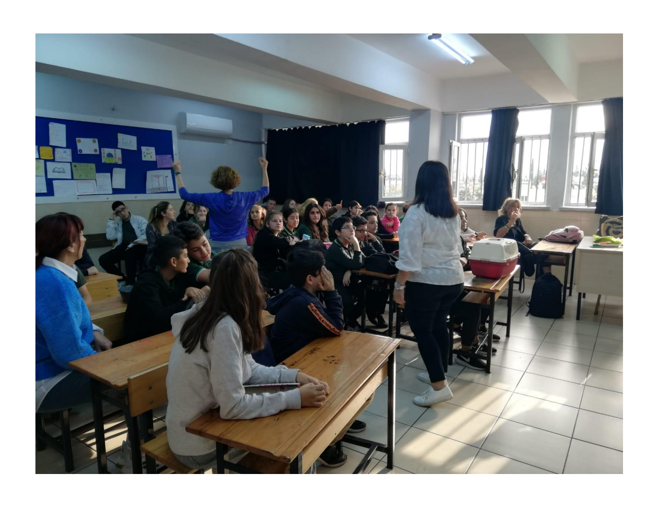
*Learning AAT or AAI training and activities