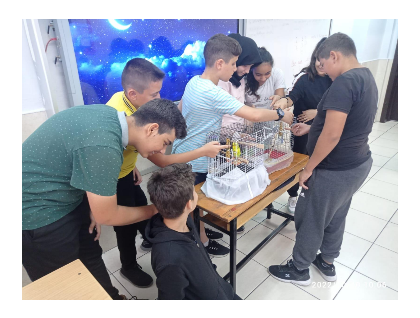
*Learning about nurturance