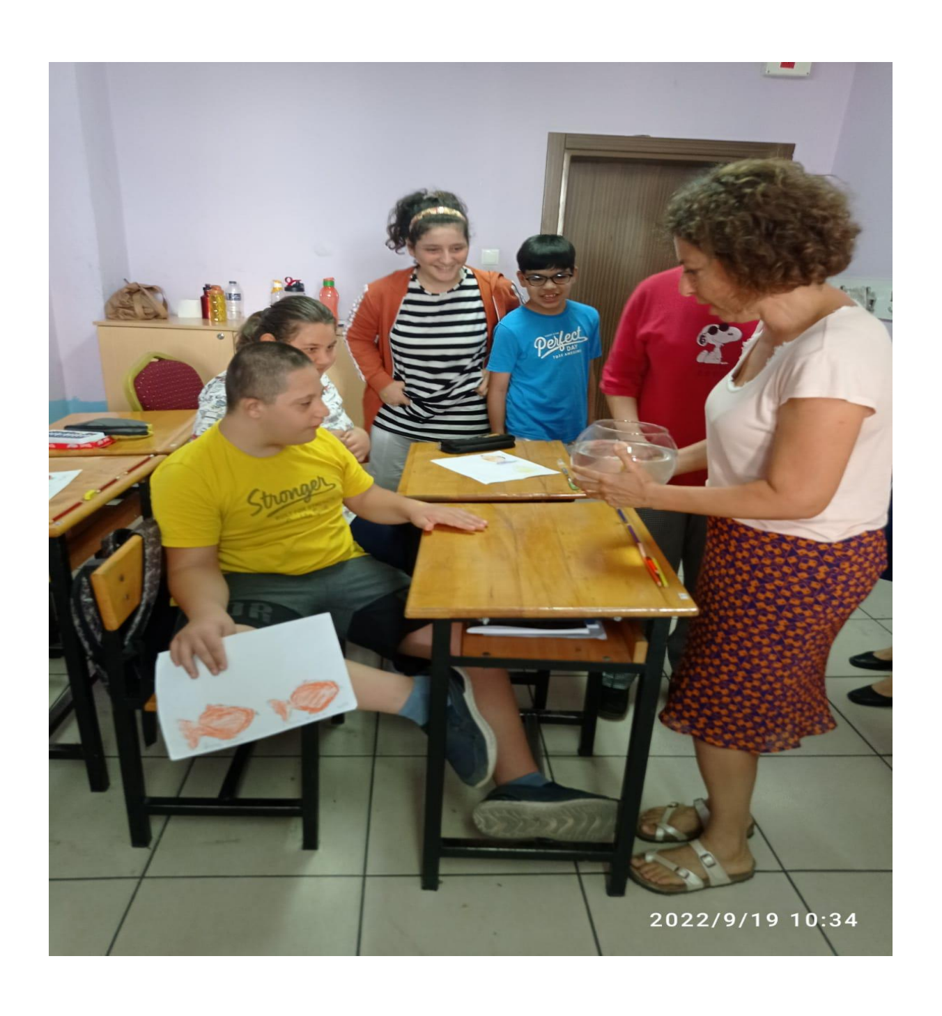
*Experiencing human animal bonding