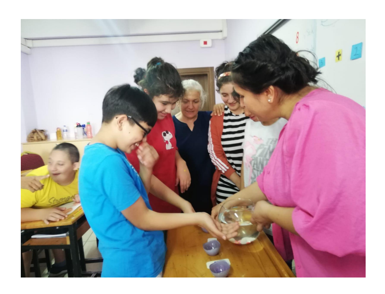
*Learning responsible pet ownership