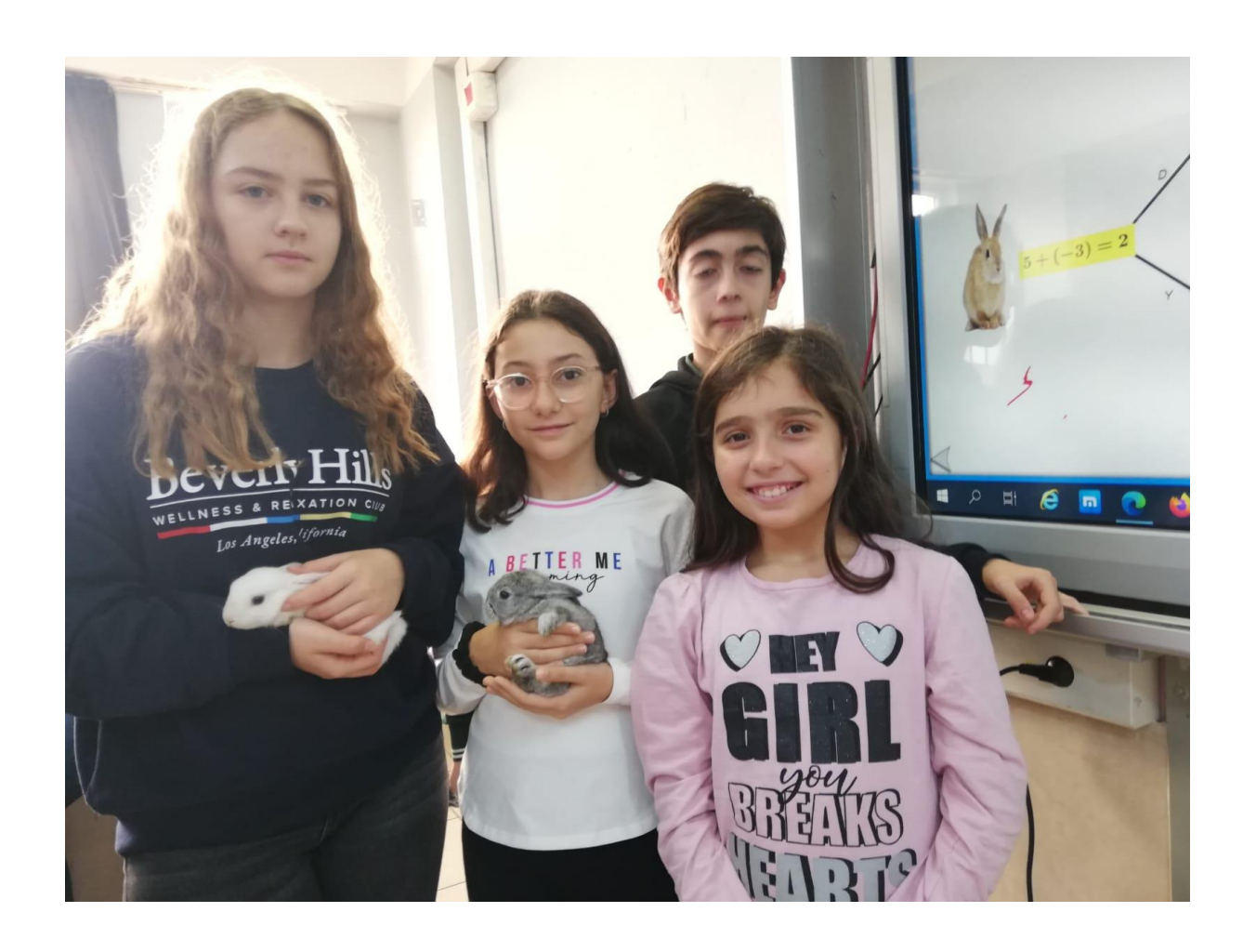
*Incorporating an attitude of kindness and compassion