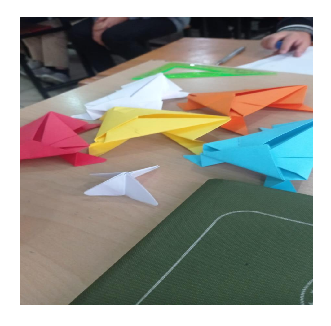
THEY CREATED MANY ITEMS.